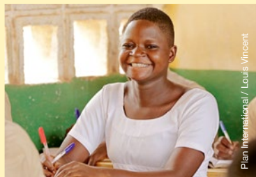
Plan International / Louis Vincent