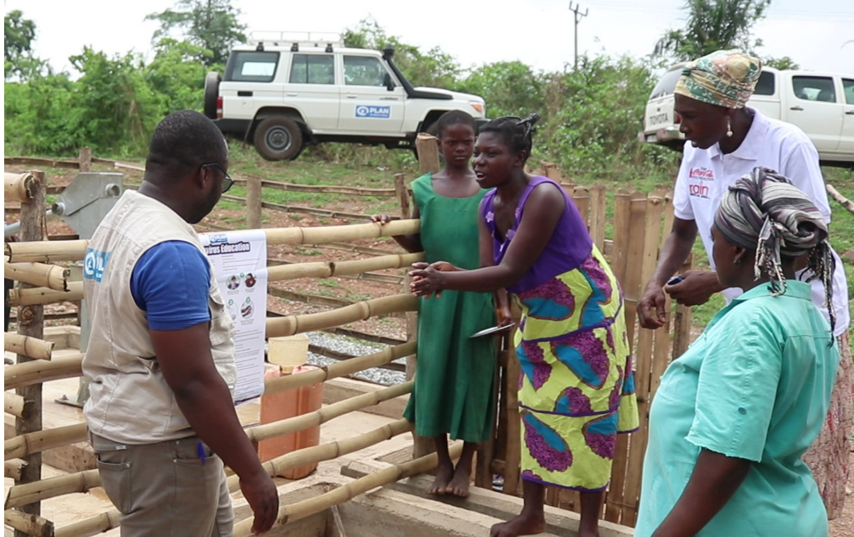
Raising awareness of Covid-19 in community in Ghana