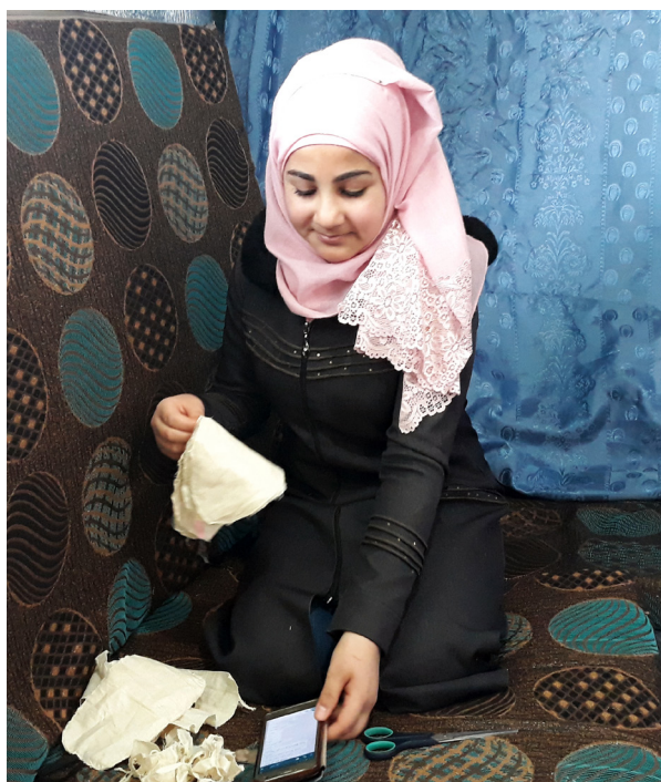
Girl makes face mask using the sanitiser handcraft kit in Jordan

Disruption of social and protective networks (hotlines, shelters and protection services) and decreased access to services, through movement restrictions and service provision all exacerbate the risk of violence against girls and women 13 .