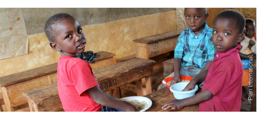
Children eating a meal of rice and beans at a school in Kenya

When we launched the appeal our supporters responded generously, raising a fantastic £543,000. Donations included landmark gifts of £100,000 from the Masonic Charitable Foundation and £100,000 from Jersey Overseas Aid. Plan International UK was also