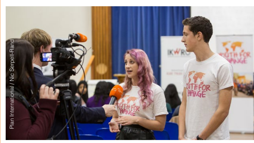
▲ Two activists get interviewed by the media

This year, YFC Tanzania helped 2,100 young people learn about FGM, child marriage