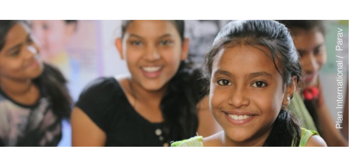
Girls at a learning centre in India run by Plan International

We've proved that evaluations carried out by children can bring insights that evaluations by consultants simply aren't able to. The UN Convention on the Rights of the Child stresses the importance of children's participation so they can share their ideas and have a say in decision making. Through child-led evaluations, we're making this happen.