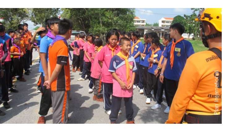
▲ Children taking part in an emergency exercise

'I'm more observant and have a better understanding of disaster preparedness and risk assessment.'