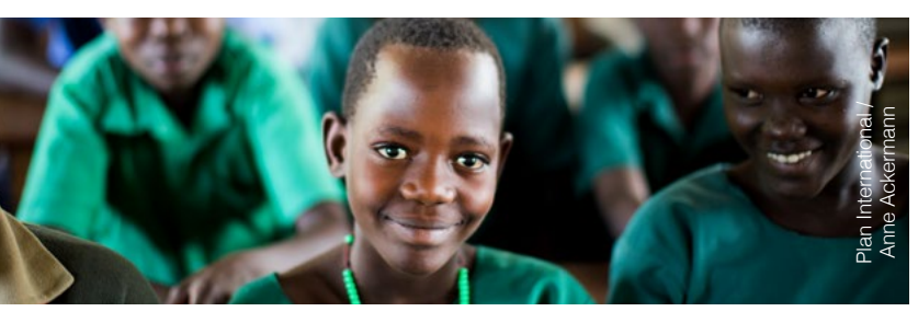
▲ Girls learn about menstrual hygiene management at school

Our new Programme Quality Tool helps us to identify any potential problems at the proposal stage. Alongside this, Plan International UK is developing detailed indicators to help us assess our projects more thoroughly: it's all part of keeping our programme work consistently of the highest quality.