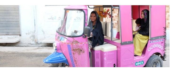
▲ In Pakistan the programme has set up a femaleonly taxi service providing women with a safe way of travelling through the city

Training sessions will help bus drivers and transport staff to understand the harassment girls face, and make public transport safer. A media campaign will help give bystanders the confidence to support girls on public transport.