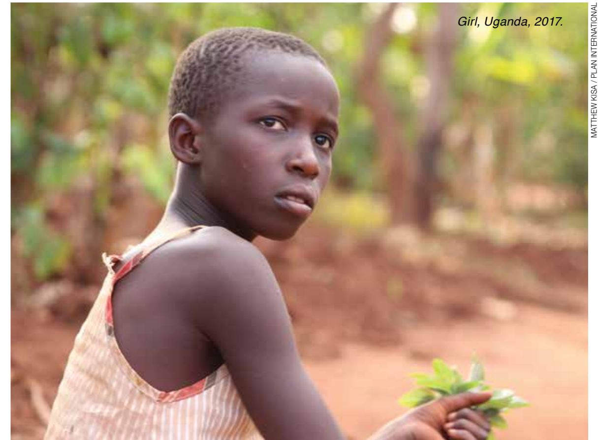
Girl, Uganda, 2017.