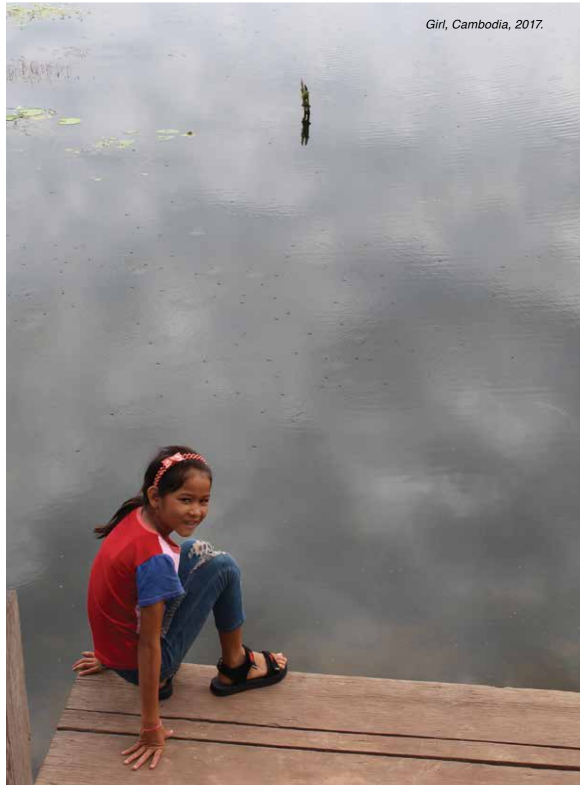
Girl, Cambodia, 2017.