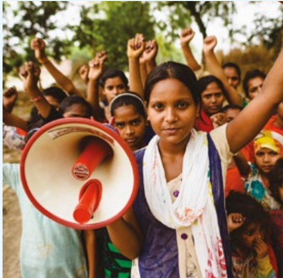
Plan International / Patrick Kaplin

Every three seconds, a girl is forced into child marriage.