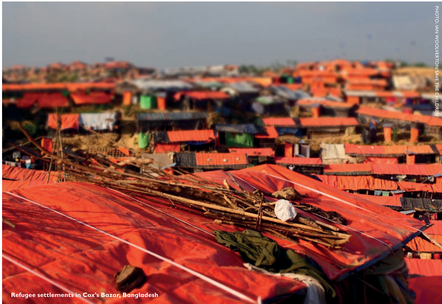
Refugee settlements in Cox's Bazar, Bangladesh

Save the Children International St Vincent House 30 Orange Street London WC2 7HH United Kingdom