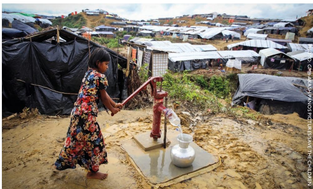
Collecting water in the settlements in Cox’s Bazar

Children said that in Myanmar, they used to help their parents in the paddy fields, fishing, in shops and with household chores. They also said they spent time studying. In the camps, children’s time is spent predominantly on collecting water, firewood