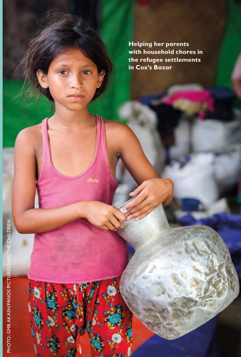
Helping her parents with household chores in the refugee settlements in Cox's Bazar