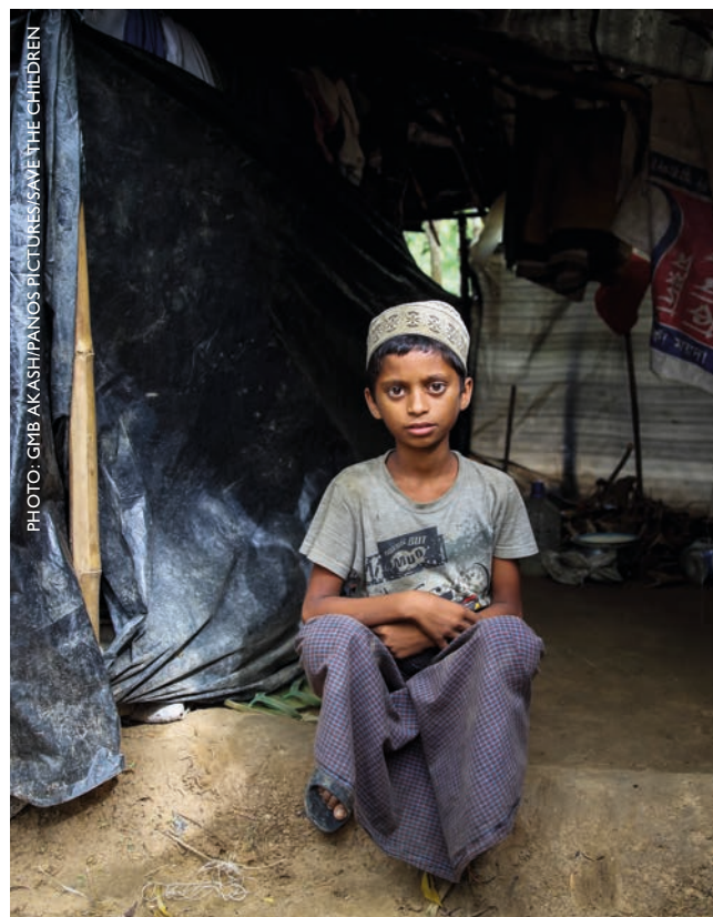
Sitting outside his family's makeshift tent, made out of bamboo and plastic sheets

According to children from the host community, the cost of food has increased since the influx, particularly the cost of meat, while food relief items commonly sold in the market (ie, rice, oil and pulses) have decreased in price. Young girls (11–14 years old) shared that they eat three times a day as usual, but the quality and diversity of what they eat has changed.