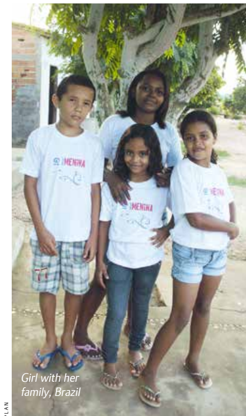
Girl with her family, Brazil

Last year, we reported on the reflections and experiences of the girls’ mothers through a series of life history interviews. Most of these women have had some level of formal education, and, as a result, are determined that their daughters too should go to school and so have the chance of greater gender equality and a more fulfilled life. We know that this generation of mothers is committed to supporting their daughters’ right to education. It is in their determination despite the poverty and risk the families contend with, that we can begin to see a brighter future for girls.