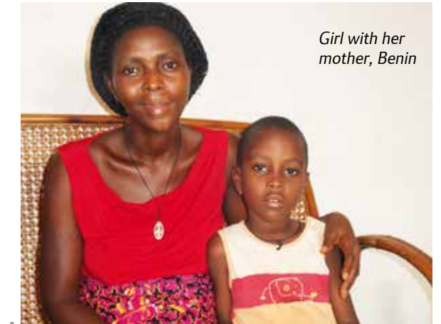
Girl with her mother, Benin