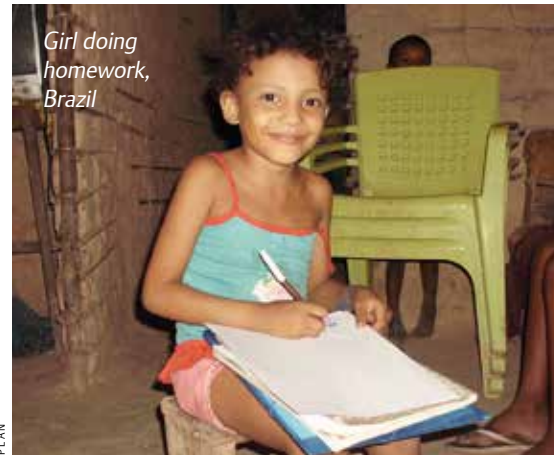
Girl doing homework, Brazil