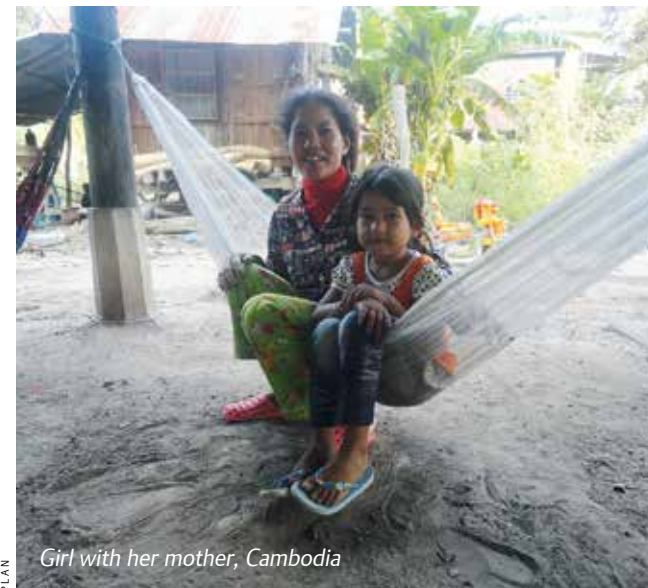
Girl with her mother, Cambodia